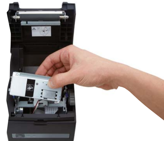
Easy Maintenance for Cutter, Print Head and Platen